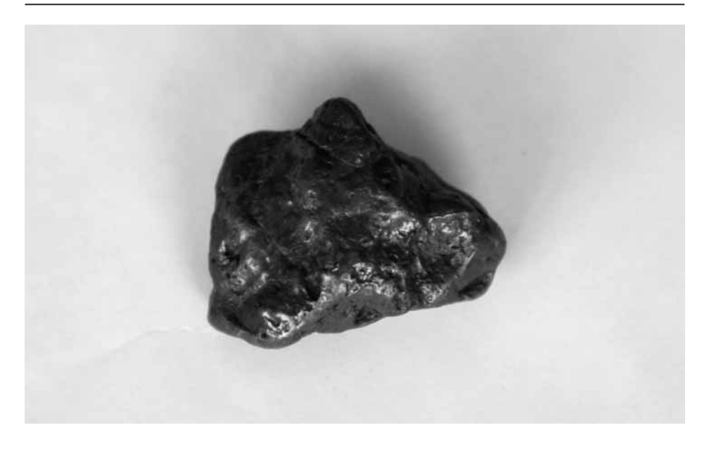
Figure 2. Iron lump from Miyako Island.