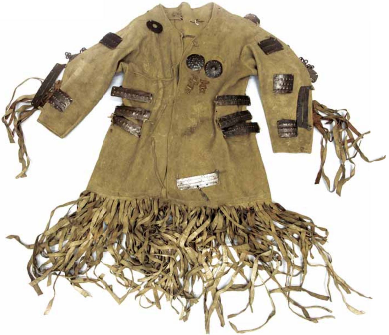
43. Cloak belonging to a shaman. Tanned deerskin, iron, copper, sinew thread ( chordae tendinae ), natural colour. Cutting, sewing, painting, forging, stamping. Length with fringe 123cm, width at the base 61cm, sleeve length 47cm. Siberia, Enisejsk Governorate (modern Krasnojarsk Krai), Turuxansk region (modern Turuxansk district). Yakuts (?), Tungusic (?) people (Evenkis). MAE of RAS No. 27-26.