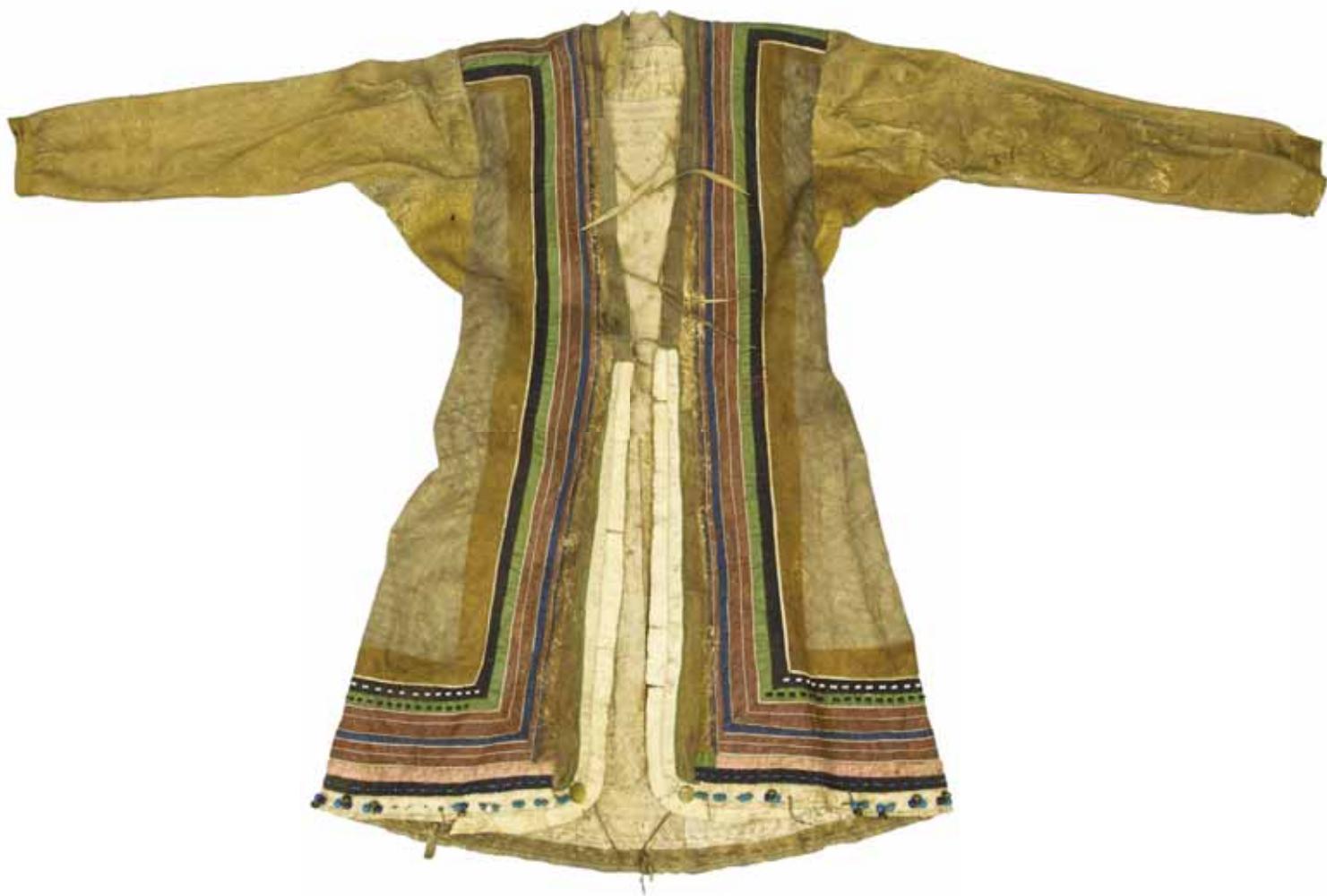
42. Men's summer coat. Tanned deerskin, natural colour, brass, deer hair, sinew thread ( chordae tendinae ), glass beads, glass marbles, cotton. Cutting, sewing, painting, moulding. Length 96cm, width at the base 66cm, sleeve length 56cm. Siberia, Enisejsk Governorate (modern Krasnojarsk Kraj), Turuxansk region (modern Turuxansk district). Yakuts (?), Tungusic (?) people (Evenkis). MAE of RAS No. 27-28.