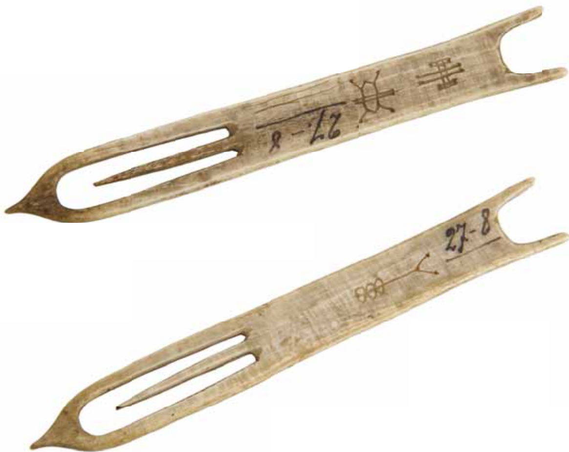
24. Needle for netting. Mammoth tusk. Bone carving. Length 14.5cm, width 2cm. Siberia, Enisejsk Governorate (modern Krasnojarsk Kraj), Turuxansk region (modern Turuxansk district). Yuraks (Nenets). MAE of RAS No. 27-8.

Siberia, Enisejsk Governorate (modern Krasnojarsk Kraj), Turuxansk region (modern Turuxansk district). First third of the 19th century.