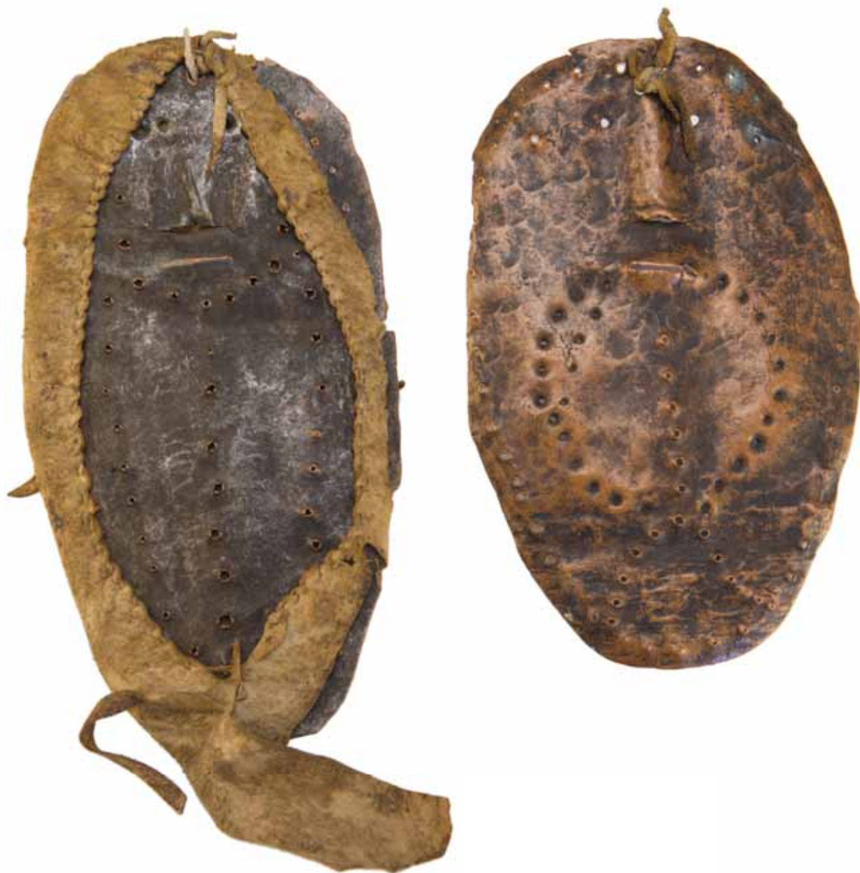
21. Masketka (metal mask). Copper, tanned deerskin. Forging, stamping. Height 16.5cm, maximum width 10.5cm. Siberia, Enisejsk Governorate (modern Krasnojarsk Kraj), Turuxansk region (modern Turuxansk district). Tungusic people (Evenkis). MAE of RAS No. 27-31/1.