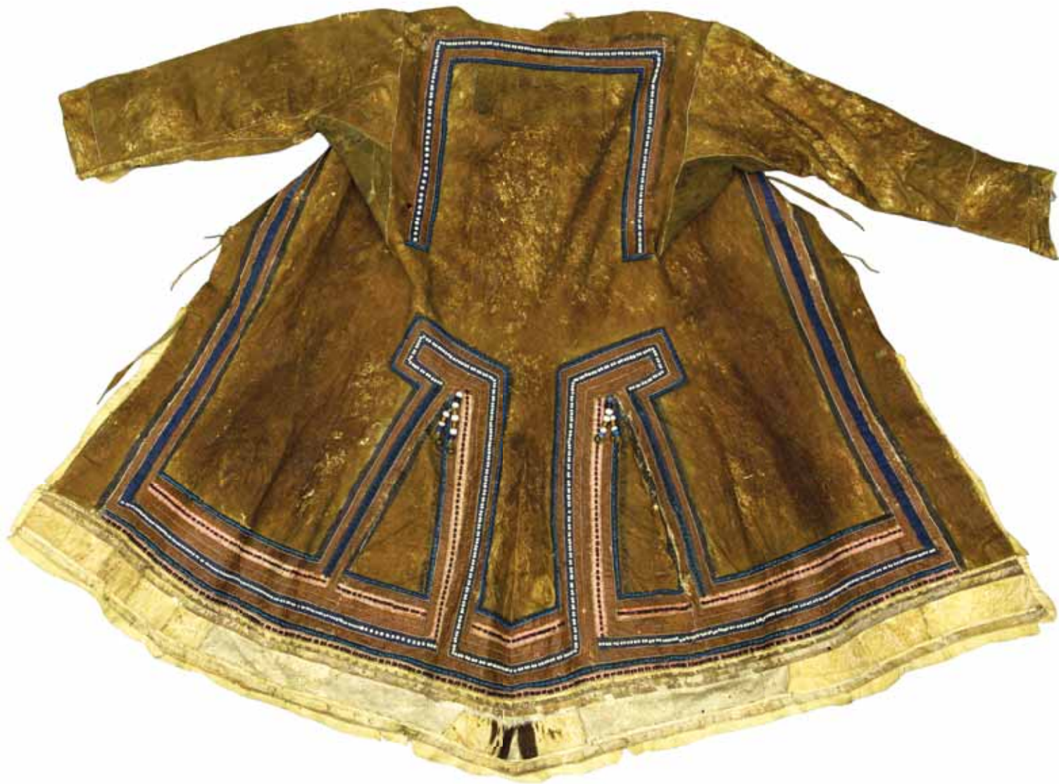
Published: Василевич, Г.М., 1958. Тунгусский кафтан. Сборник Музея антропологии и этнографии XVIII : 122–178, p. 147, Figure 10. Издательство АН СССР, Москва - Ленинград.