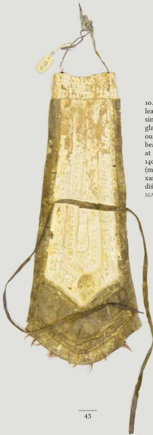
10. Women's bib. Tanned deerskin, leather, goat fur, fabrics, cotton, sinew thread ( chordae tendinae ), glass beads, pearls, natural colours. Cutting, sewing, painting, beadwork. Length 63cm, width at the base 25cm, width at the top 14cm. Siberia, Enisejsk Governorate (modern Krasnojarsk Kraj), Turuxansk region (modern Turuxansk district). Tungusic people (Evenkis). MAE of RAS No. 27-16.