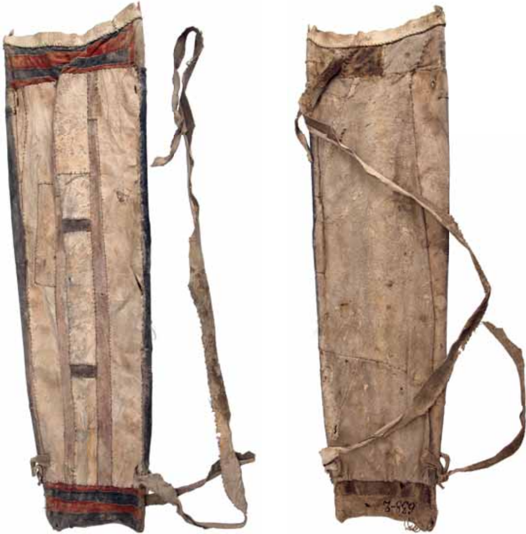
39. Quiver. Tanned deerskin, sinew thread (chordae tendinae), wood. Sewing, wood processing. Maximum length 58cm, maximum width 16cm, strap lengths 87cm and 27cm. Siberia, Enisejsk Governorate (modern Krasnojarsk Kraj), Turuxansk region (modern Turuxansk district). Enets. MAE of RAS No. 638-2.

Siberia, Enisejsk Governorate (modern Krasnojarsk Kraj), Turuxansk region (modern Turuxansk district). First third of the 19th century.