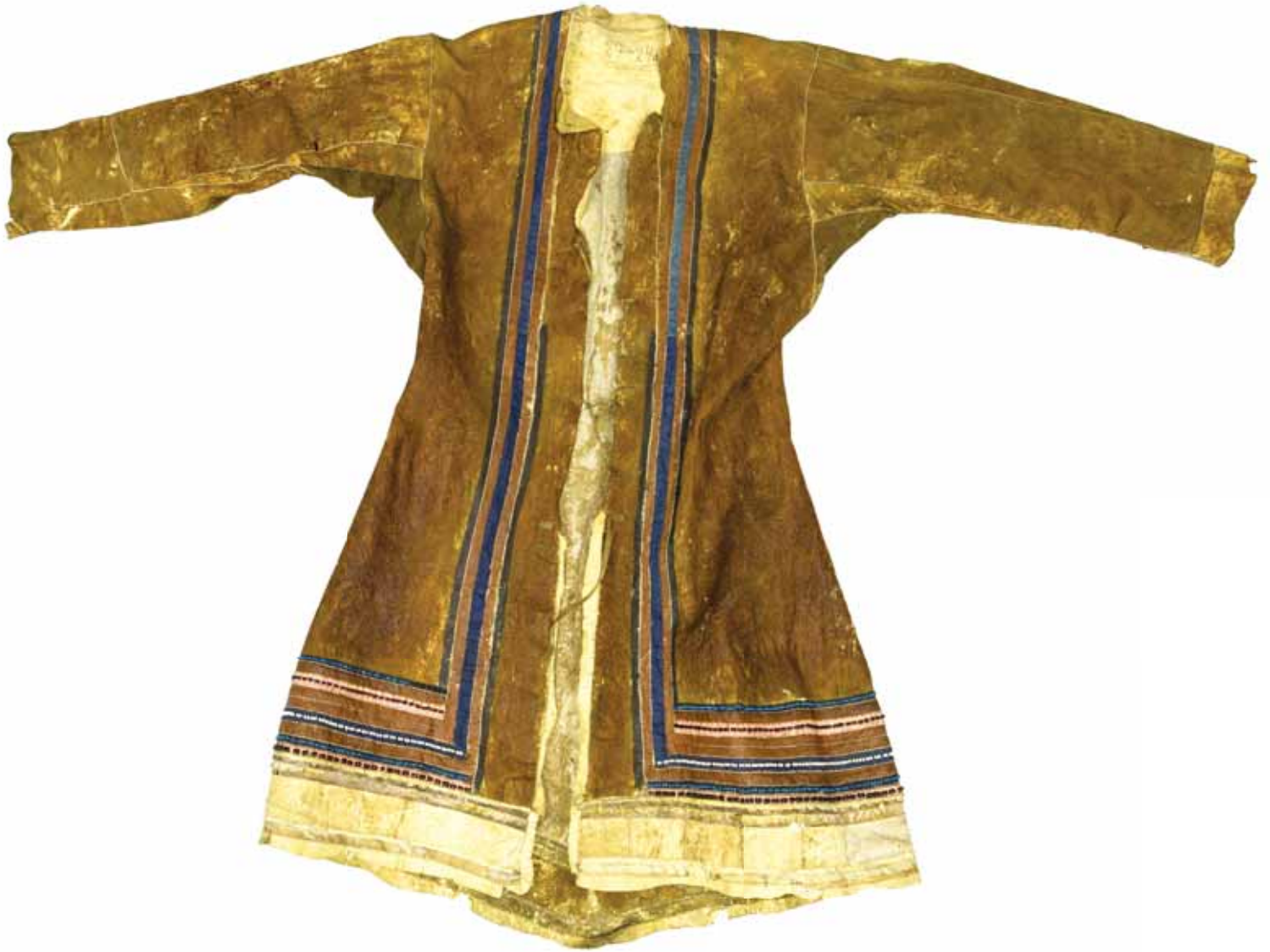
4. Men's summer coat. Tanned deerskin, cotton fabric, leather, glass beads, glass marbles, sinew thread ( chordae tendinae ), natural colours. Cutting, sewing, painting, beadwork. Length 93cm, width at the hem 130cm, sleeve length 44cm. Siberia, Enisejsk Governorate (modern Krasnojarsk Krai), Turuxansk region (modern Turuxansk district). Tungusic people (Evenkis). MAE of RAS No. 27-24a (which forms a set with item No. 27-24b).