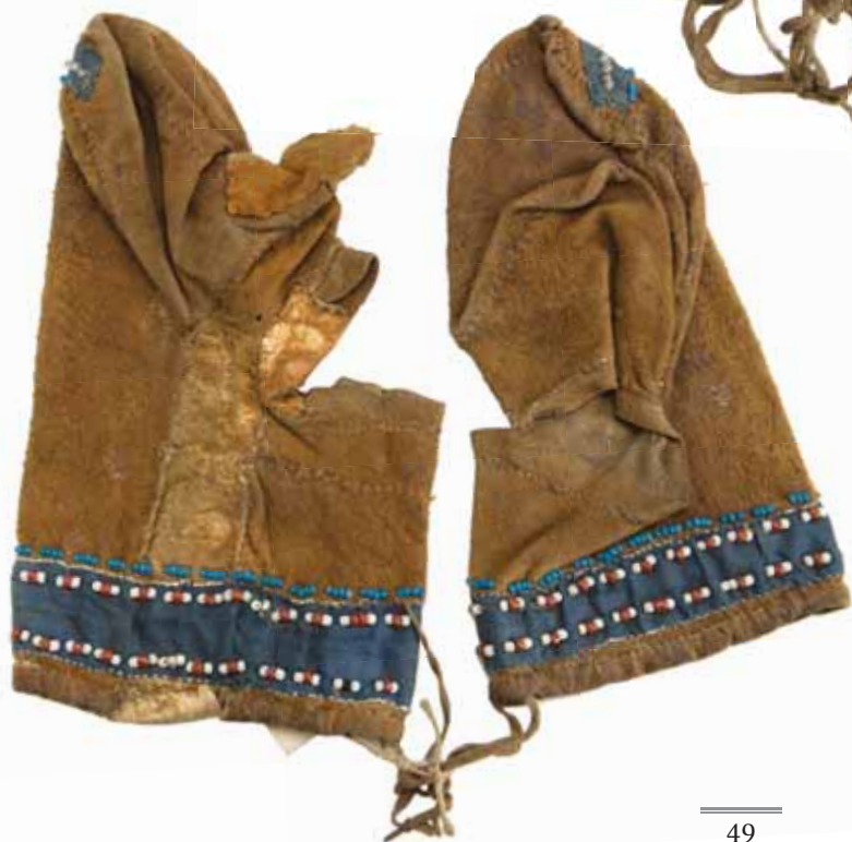
14. Mittens. Tanned deerskin, fabrics, cotton, deer hair, glass beads, mineral colours, sinew thread ( chordae tendinae ). Cutting, sewing, painting, beadwork. Length 22.5cm, width 12cm. Siberia, Enisejsk Governorate (modern Krasnojarsk Kraj), Turuxansk region (modern Turuxansk district). Tungusic people (Evenkis). MAE of RAS No. 27-14 / 1 & 2.