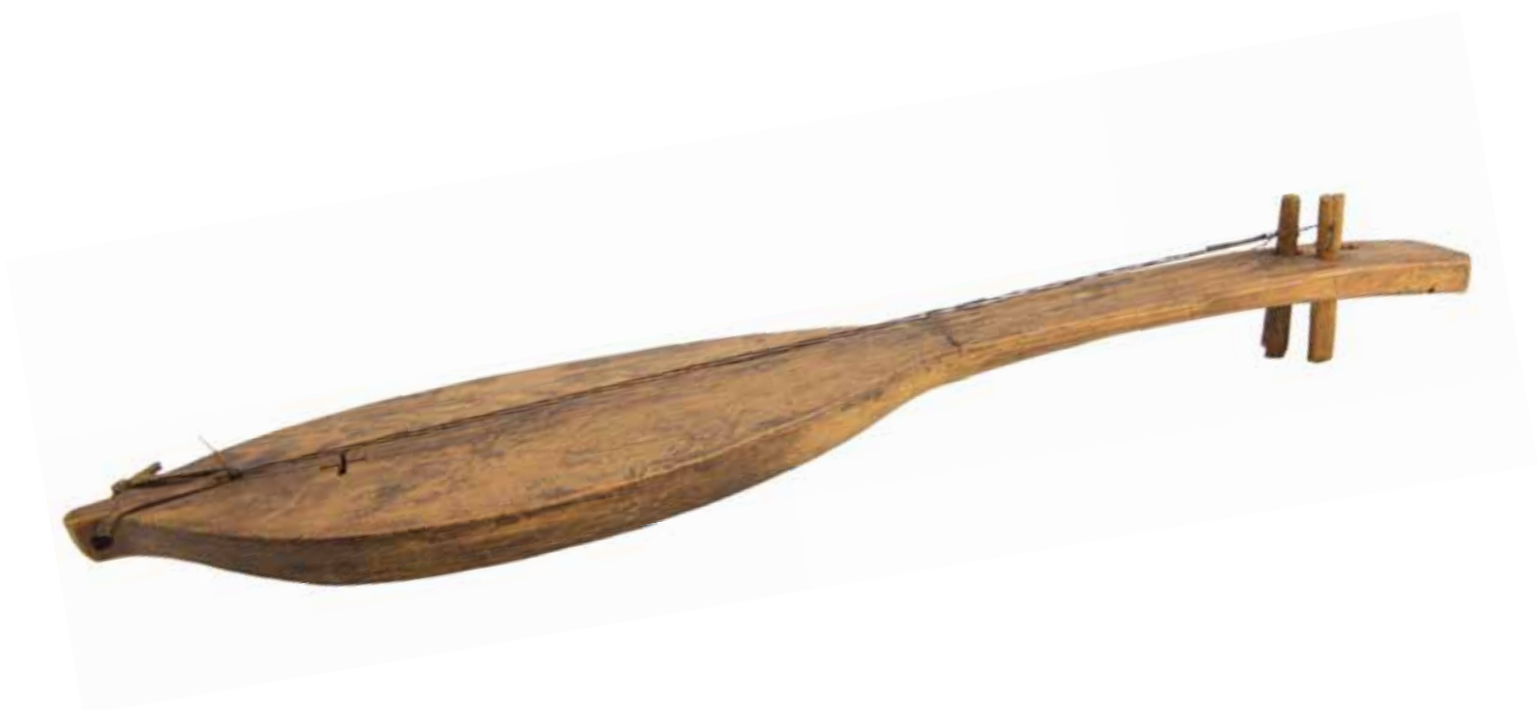
34. Musical instrument. Wood, sinew thread (chordae tendinae), glue. Carving, gluing. Length 47.5cm, width 11cm, height 3.8cm. West Siberia. Tobolsk Governorate (modern Tjumen' region). Ostyaks (Khan-tys). MAE of RAS No. 27-37.