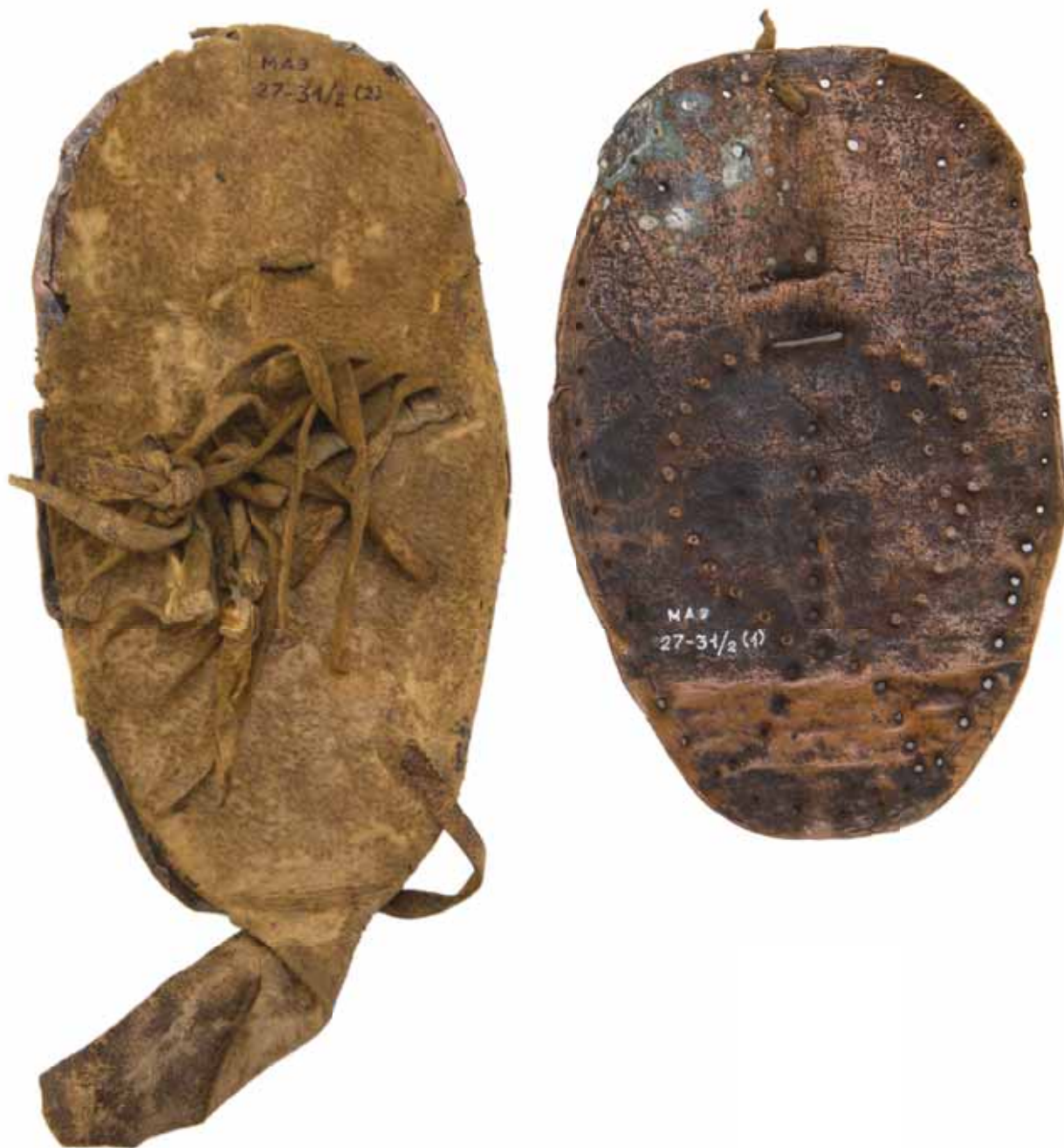
22. Masketka (metal mask). Copper, tanned deerskin. Forging, stamping. Height 19cm, maximum width 9.5cm. Siberia, Enisejsk Governorate (modern Krasnojarsk Kraj), Turuxansk region (modern Turuxansk district). Tungusic people (Evenkis). MAE of RAS No. 27-31/2.