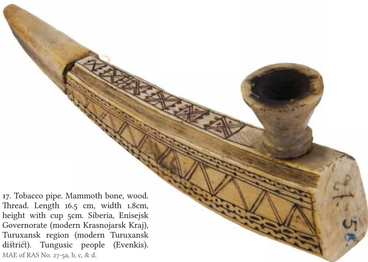
17. Tobacco pipe. Mammoth bone, wood. Thread. Length 16.5 cm, width 1.8cm, height with cup 5cm. Siberia, Enisejsk Governorate (modern Krasnojarsk Kraj), Turuxansk region (modern Turuxansk district). Tungusic people (Evenkis). MAE of RAS No. 27-5a, b, c, & d.