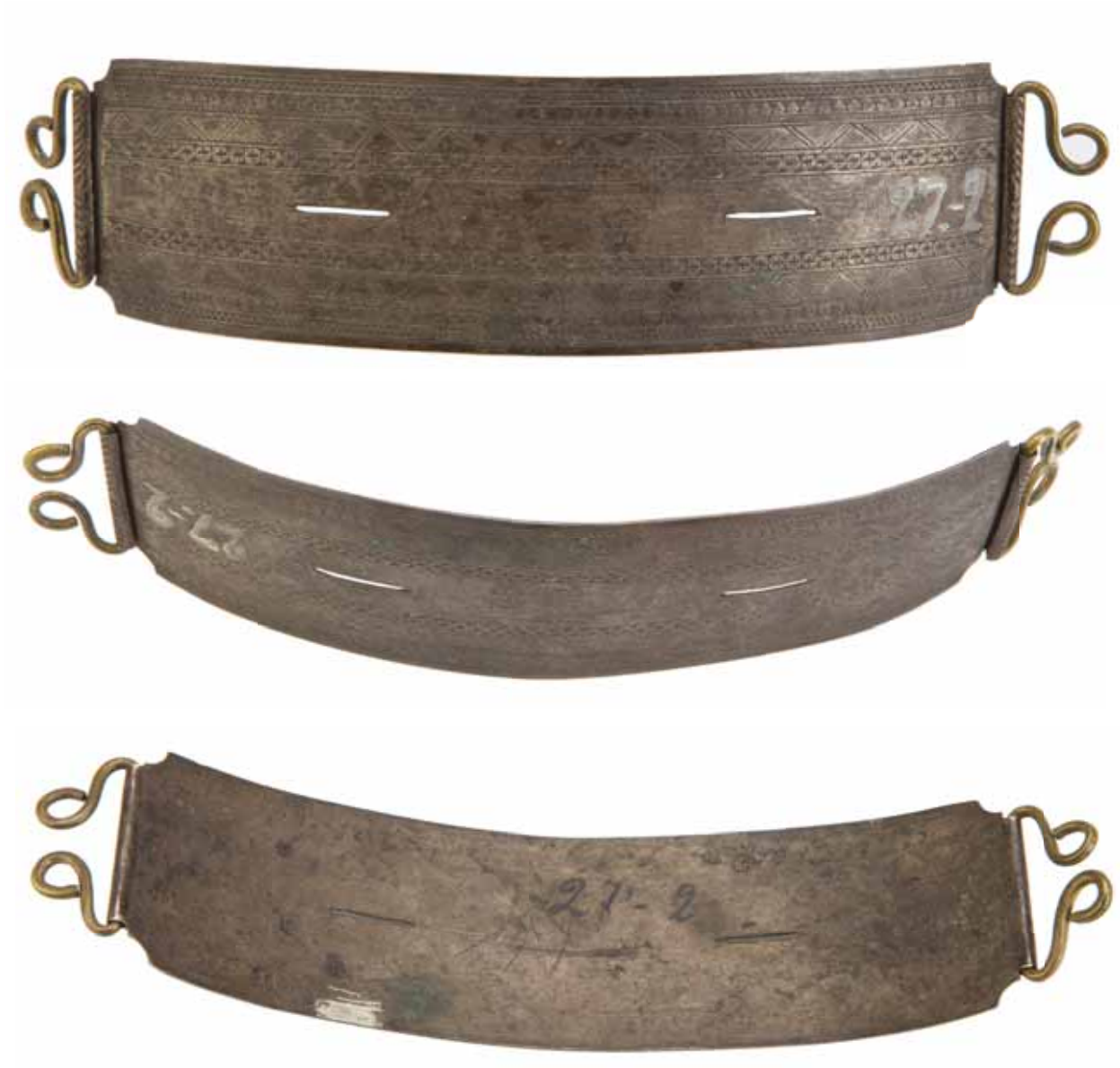
25. Snow goggles. Silver, bronze. Hatching. Length with headbands 13.5cm, width 4.5cm. Siberia, Enisejsk Governorate (modern Krasnojarsk Kraj), Turuxansk region (modern Turuxansk district). Yuraks (Nenets). MAE of RAS No. 27-2.