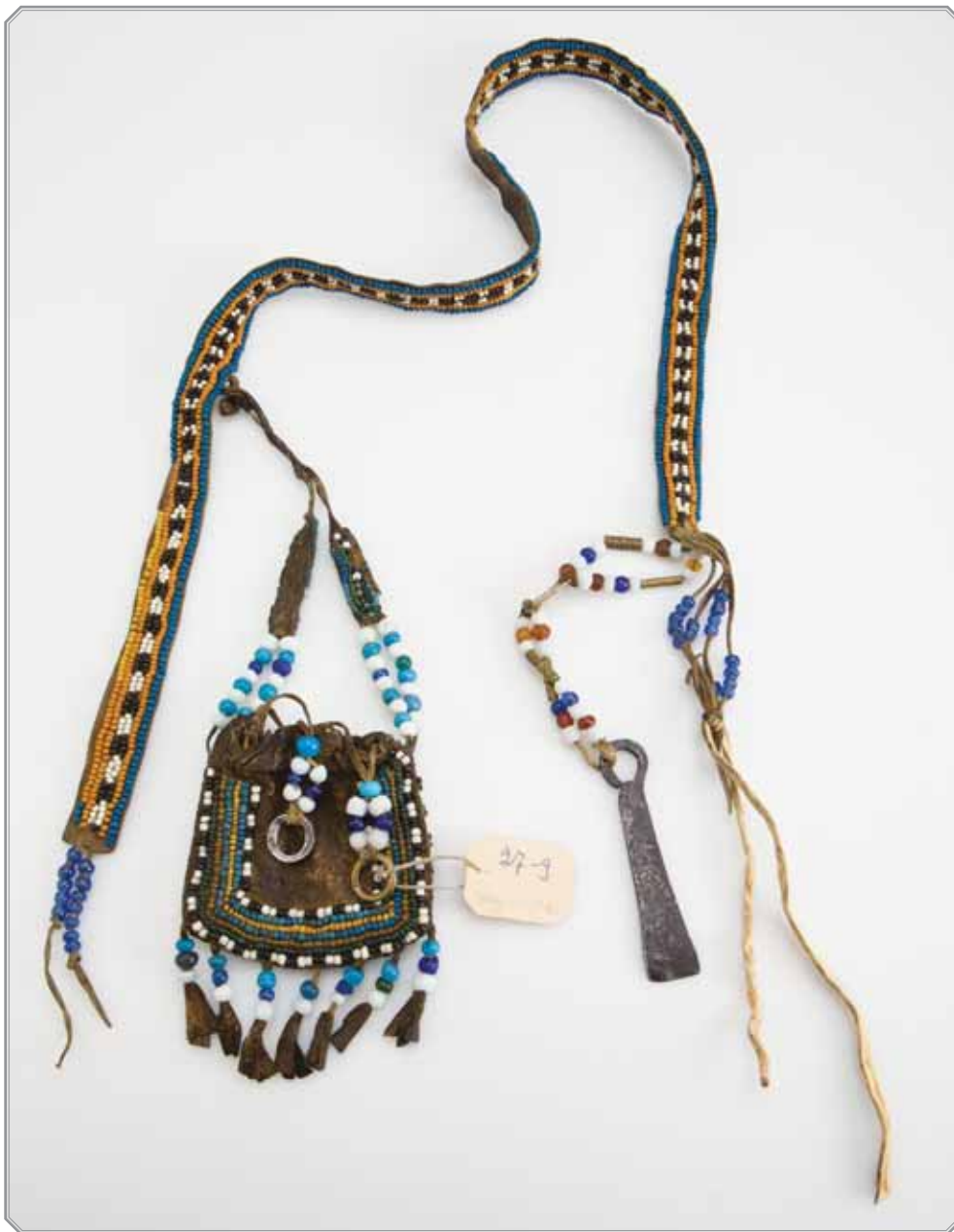
18. Pouch for tobacco with sling. Tanned deerskin, leather, glass beads, glass pearls, iron, copper. Chamois dressing, sewing, beading, moulding, hatching. Pouch length with tassels 14.5cm, pouch width 10cm, sling total length 134cm, sling width 2cm. Siberia, Enisejsk Governorate (modern Krasnojarsk Kraj), Turuxansk region (modern Turuxansk district). Tungusic people (Evenkis). MAE of RAS No. 27-9.