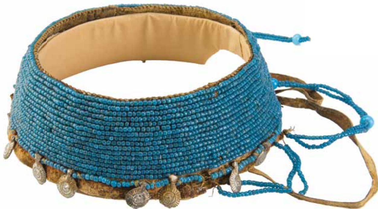
16. Headband. Tanned deerskin, glass beads, tin, sinew thread (chordae tendinae). Cutting, beadwork, stamping. Height 6cm, diameter at the base 18cm. Siberia, Enisejsk Governorate (modern Krasnojarsk Kraj), Turuxansk region (modern Turuxansk district). Tungusic people (Evenkis). MAE of RAS No. 27-23.