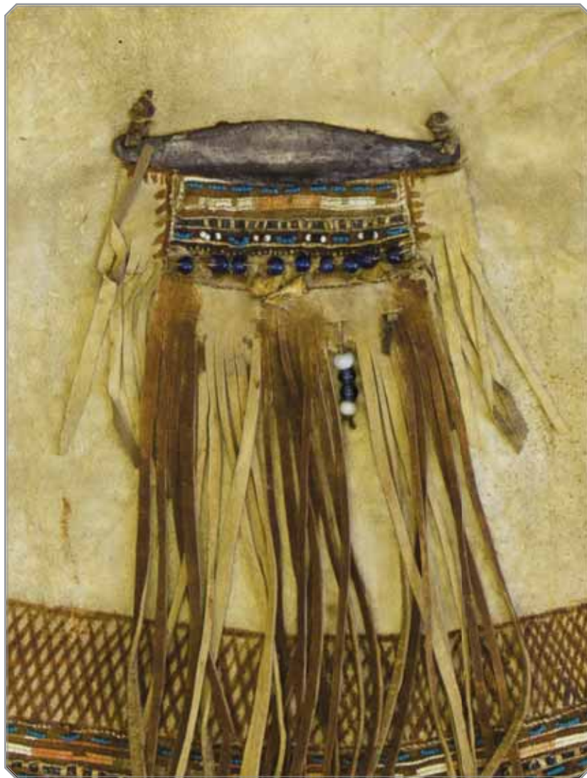
5. Men's summer breast collar. Tanned deerskin, leather, glass beads, sinew thread ( chordae tendinae ), metal, mineral paint. Cutting, sewing, embroidery, dyeing, metal processing. Length with fringe 88cm, width 72cm. Siberia, Enisejsk Governorate (modern Krasnojarsk Kraj), Turuxansk region (modern Turuxansk district). Tungusic people (Evenkis). MAE of RAS No. 27-24b (which forms a set with item No. 27-24a).