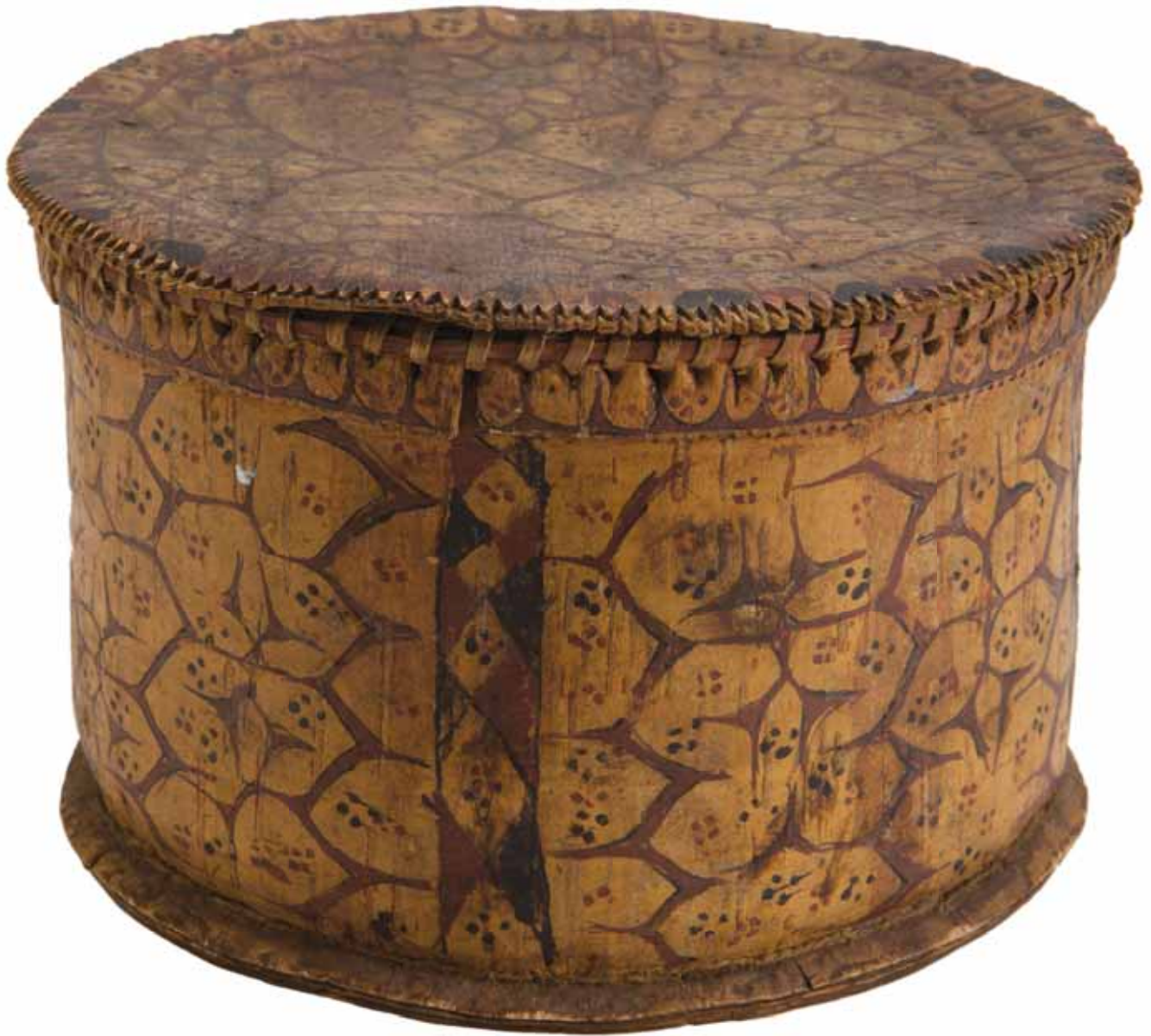
36. Box with lid. Birch, sinew thread (chordae tendinae), wood, fish glue, natural colour. Cutting, stitching, colouring, gluing. Height 11.5cm, diameter 18cm. Siberia, Enisejsk Governorate (modern Krasnojarsk Krai), Turuxansk region (modern Turuxansk district). Kets. MAE of RAS No. 27-40a & b.