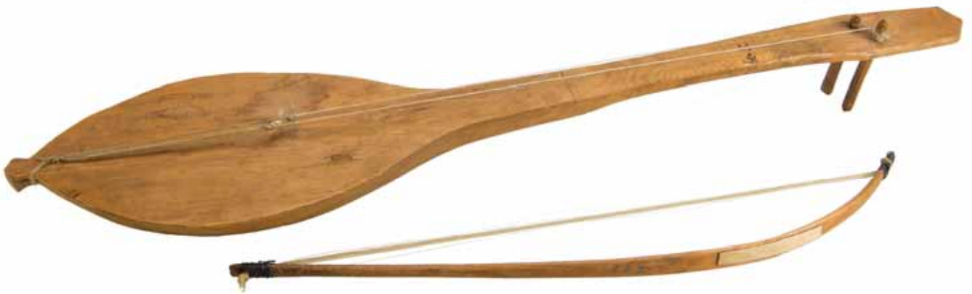
44. Musical instrument with bow. Wood, horse hair, glue. Carving, gluing. Instrument length 57cm, width 11cm, height 4.5cm, bow length 39cm. Siberia, Enisejsk Governorate (modern Krasnojarsk Kraj), Turuxansk region (modern Turuxansk district). Selkups. MAE of RAS No. 27-39ab.

Siberia, Enisejsk Governorate (modern Krasnojarsk Kraj), Turuxansk region (modern Turuxansk district). First third of the 19th century.