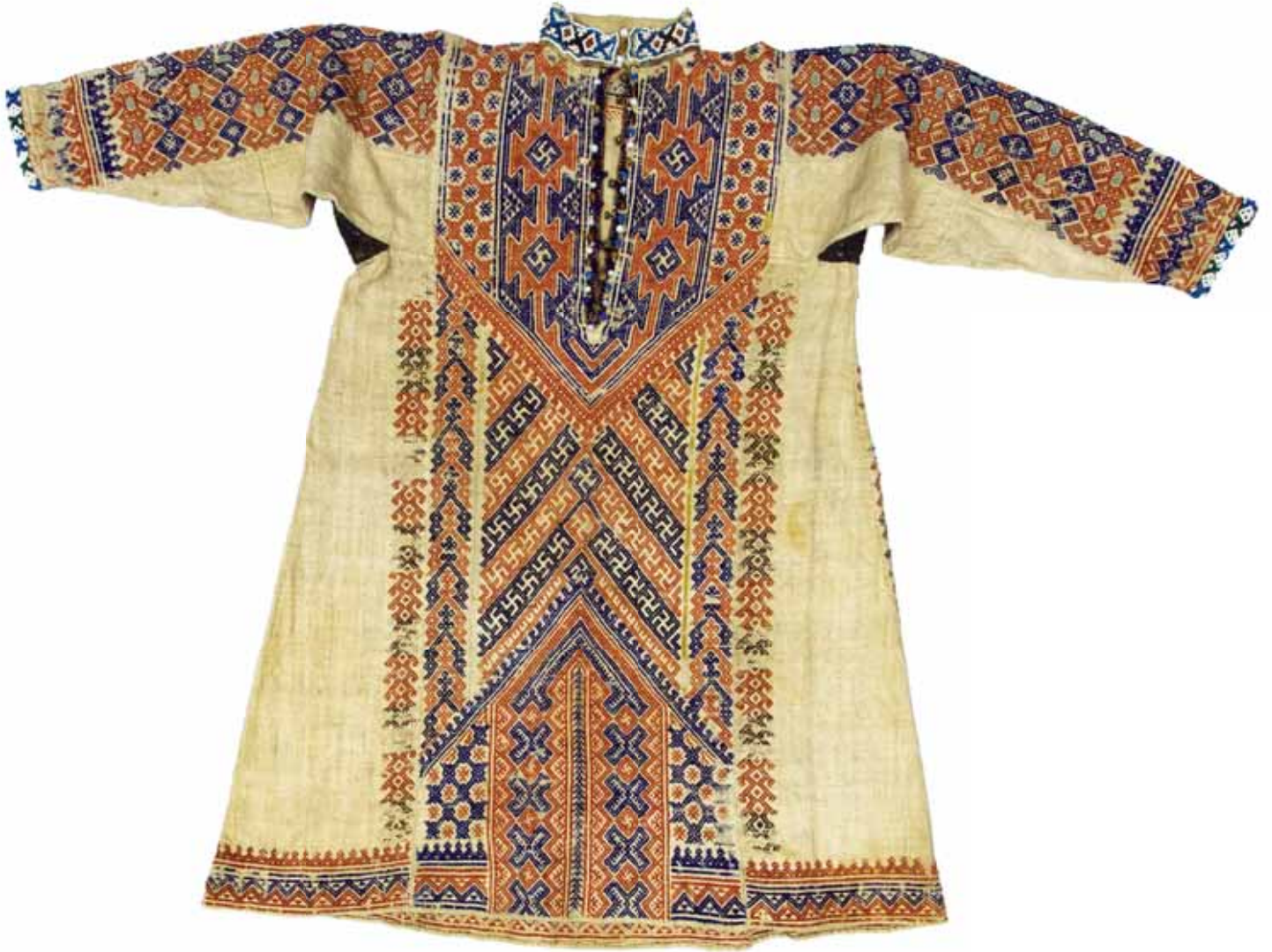
32. Women's shirt. Nettle cloth, woollen thread, glass marbles, glass beads, copper. Cutting, sewing, thread embroidery, moulding, beading. Length 110cm, width at the base 87cm, sleeve length 56cm. West Siberia. Tobol'sk Governorate (modern Tjumen' region). Ostyaks (Khantys). MAE of RAS No. 27-35.

Tobol'sk Governorate (modern Tjumen' region). First third of the 19th century.