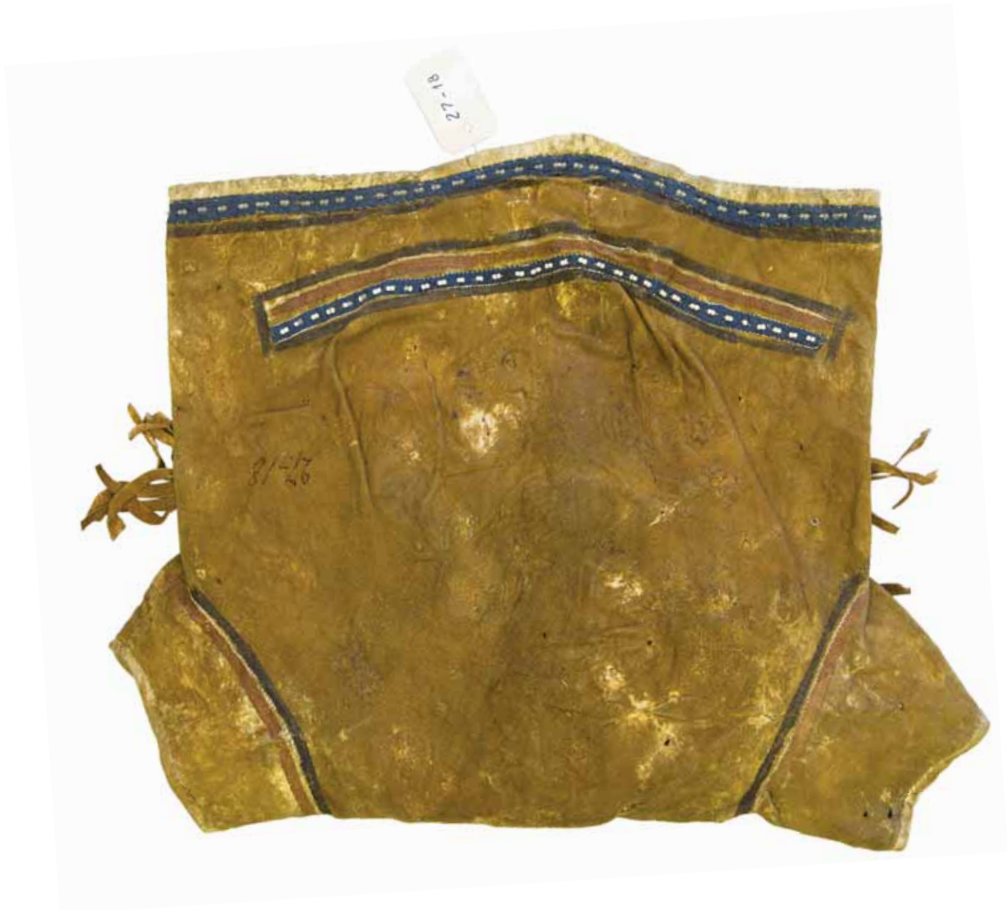
9. Women's trousers. Tanned deerskin, fabrics, cotton, sinew thread (chordae tendinae), glass beads, pearls, natural colours, deer hair. Cutting, sewing, painting, beadwork. Length 47cm, width at the base 58cm width at the top 48cm. Siberia, Enisejsk Governorate (modern Krasnojarsk Krai), Turuxansk region (modern Turuxansk district). Tungusic people (Evenkis). MAE of RAS No. 27-18.