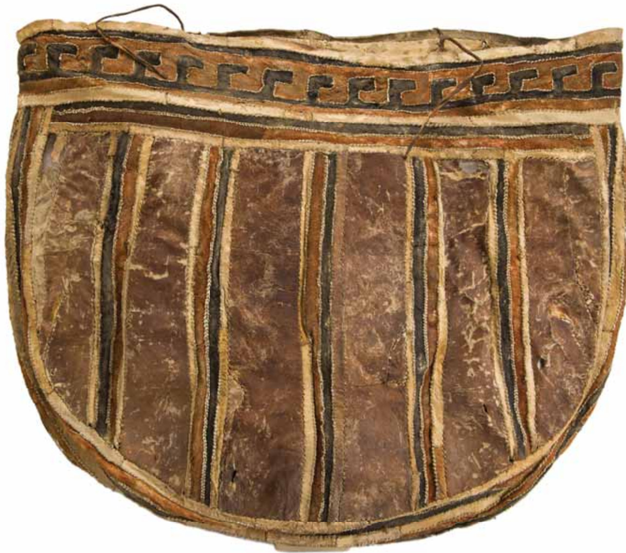
41. Bag for storing items. Tanned deerskin, sinew thread (chordae tendinae). Sewing. Maximum height 35.5cm, maximum width 43cm. Siberia, Enisejsk Governorate (modern Krasnojarsk Kraj), Turuxansk region (modern Turuxansk district). Enets. MAE of RAS No. 638-1.