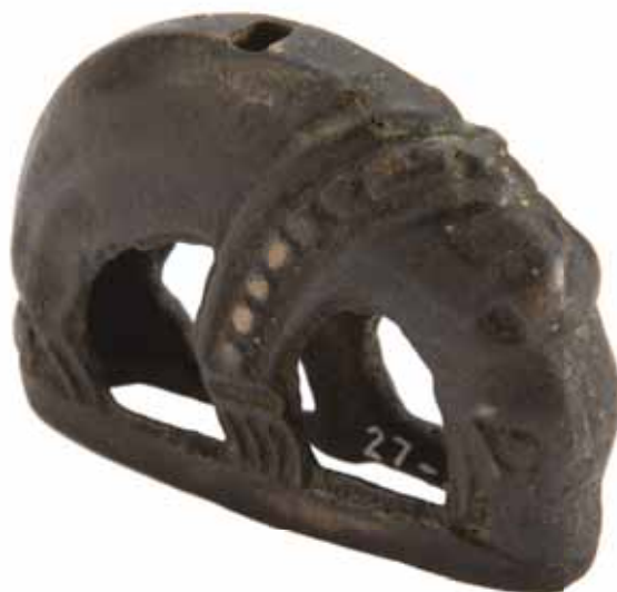
23. A figurine of a bear. Bronze. Casting, drilling, grinding. Length 6.3cm, width 1.5cm, height 4.2cm. Siberia, Enisejsk Governorate (modern Krasnojarsk Kraj), Turuxansk region (modern Turuxansk district). Tungusic people (Evenkis). Archaeological object. Used by the Evenkis. MAE of RAS No. 27-32.