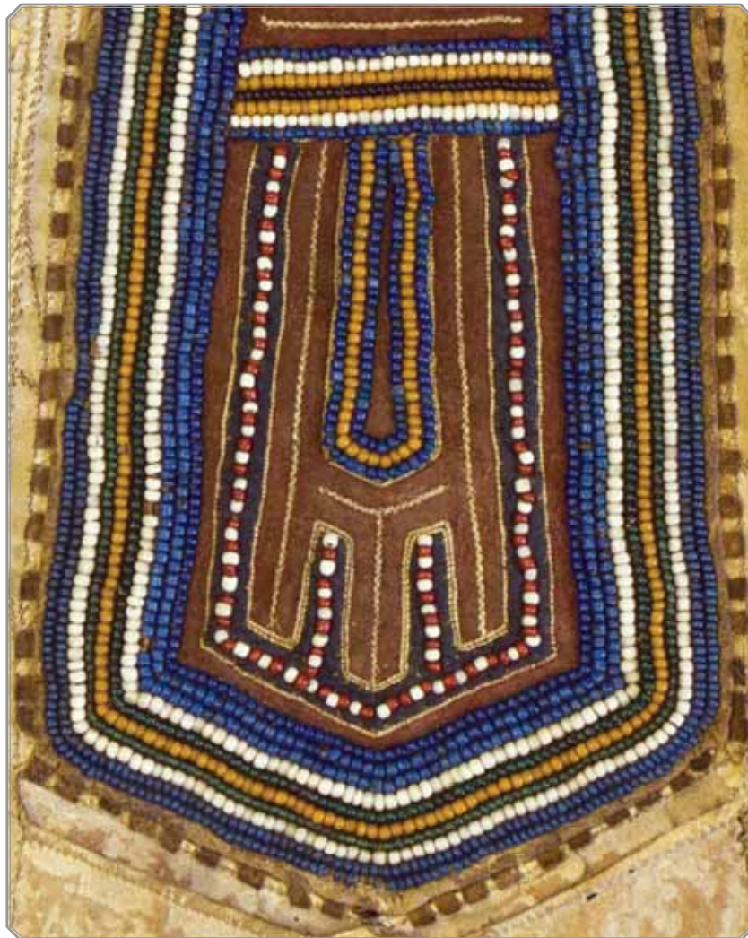
8. Bib. Tanned deerskin, leather, goat fur, cotton fabric, glass beads, sinew thread ( chordae tendinae ), natural colour. Cutting, sewing, painting, beadwork. Length 68cm; width at the base 29cm; width at the top 15.5cm. Siberia, Enisejsk Governorate (modern Krasnojarsk Kraj), Turuxansk region (modern Turuxansk district). Tungusic people (Evenkis). MAE of RAS No. 27-20.