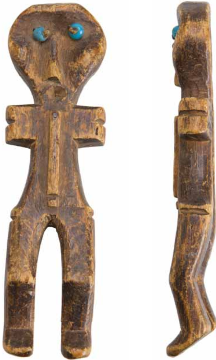
19. Spirit depiction. Wood, glass beads, skin. Relief carving, drilling. Height 20.5cm, maximum width 5.5cm. Siberia, Enisejsk Governorate (modern Krasnojarsk Kraj), Turuxansk region (modern Turuxansk district). Tungusic people (Evenkis). MAE of RAS No. 27-30/1.