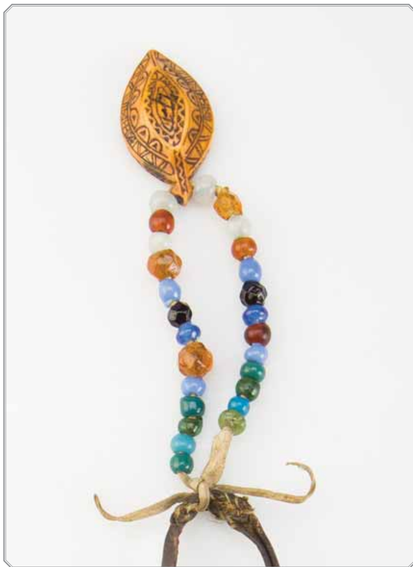
29. Pouch. Tanned deerskin, cotton fabric, glass beads, bronze, steel, bone. Skin dressing, sewing, embroidery with beads, bone carving, forging, stamping. Length 9.5cm, width 7.5cm. Siberia, Enisejsk Governorate (modern Krasnojarsk Kraj), Turuxansk region (modern Turuxansk district). Yuraks (Nenets). MAE of RAS No. 27-10.