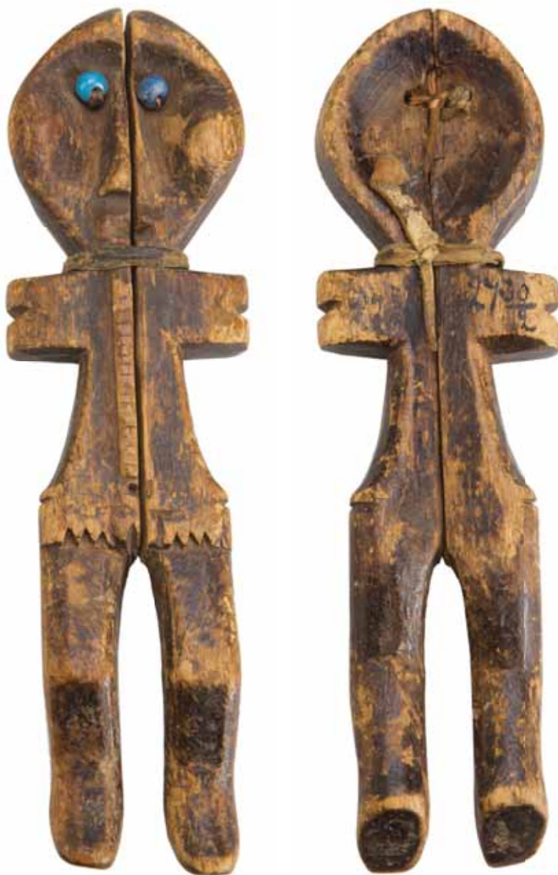
20. Spirit depiction. Wood, glass beads, skin. Relief carving, drilling. Height 23,5cm, maximum width 6cm. Siberia, Enisejsk Governorate (modern Krasnojarsk Kraj), Turuxansk region (modern Turuxansk district). Tungusic people (Evenkis). MAE of RAS No. 27-30/2.

Published: Иванов, С.В., 1970. Скульптура народов Севера Сибири. XIX – первая половина XX в. , p. 175, Figure 159. Издательство «Наука», Ленинградское отделение.