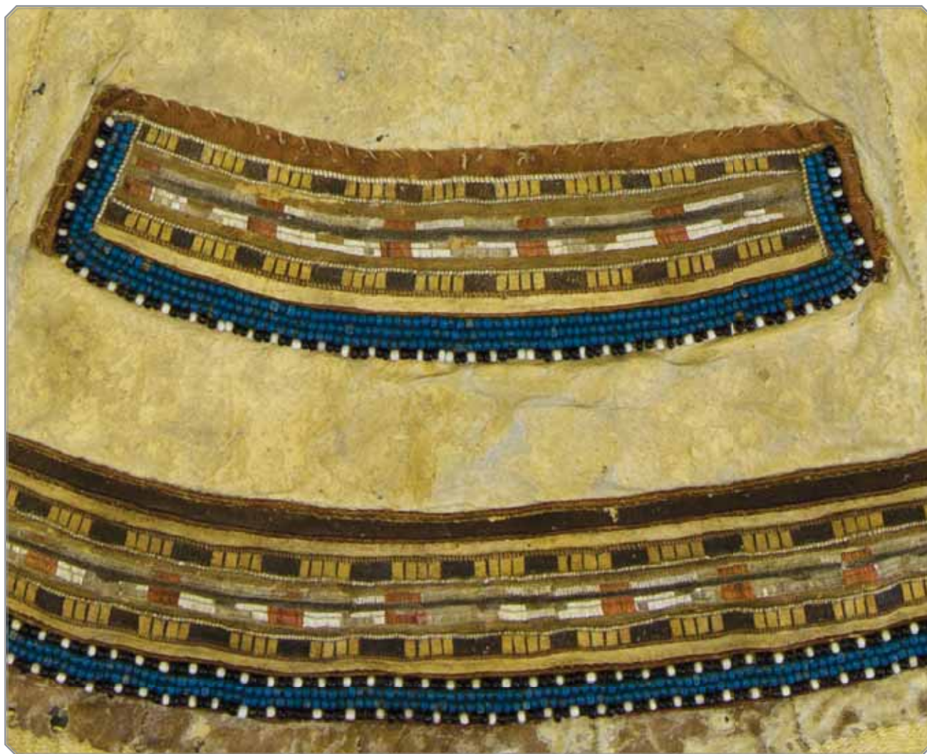
7. Men's apron. Tanned deerskin, leather, sinew thread (chordae tendinae), glass beads, natural colour. Cutting, sewing, painting, beadwork. Length 81cm, width at the hem 47cm, width at the top 13cm. Siberia, Enisejsk Governorate (modern Krasnojarsk Krai), Turuxansk region (modern Turuxansk district). Tungusic people (Evenkis). MAE of RAS No. 27-22.