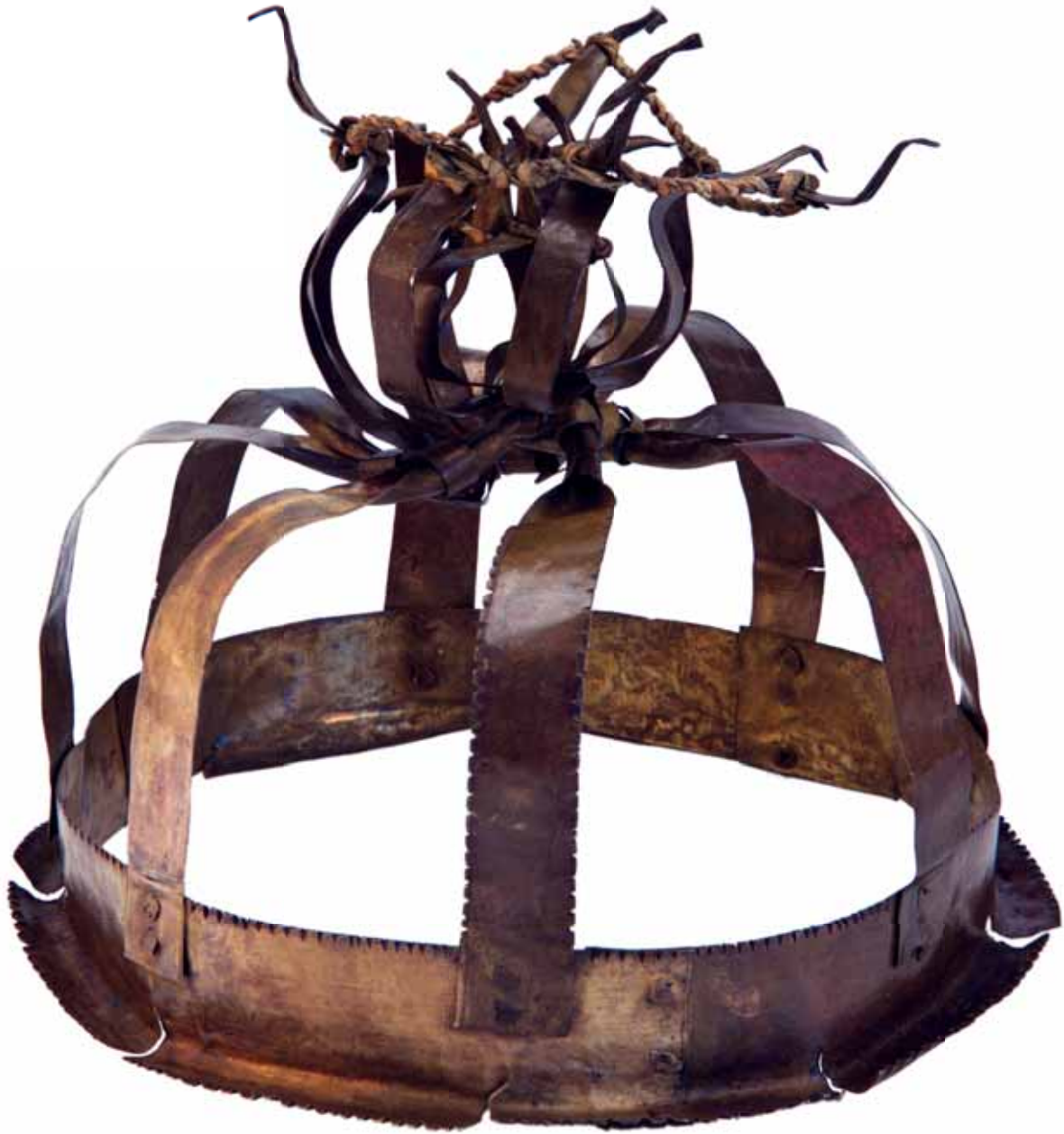
38. Shaman headgear. Brass, chamois. Metal processing, chamois dressing, riveting. Height 18cm, diameter at the base 17cm. Siberia, Enisejsk Governorate (modern Krasnojarsk Kraj), Turuxansk region (modern Turuxansk district). Kets. MAE of RAS No.27-25.