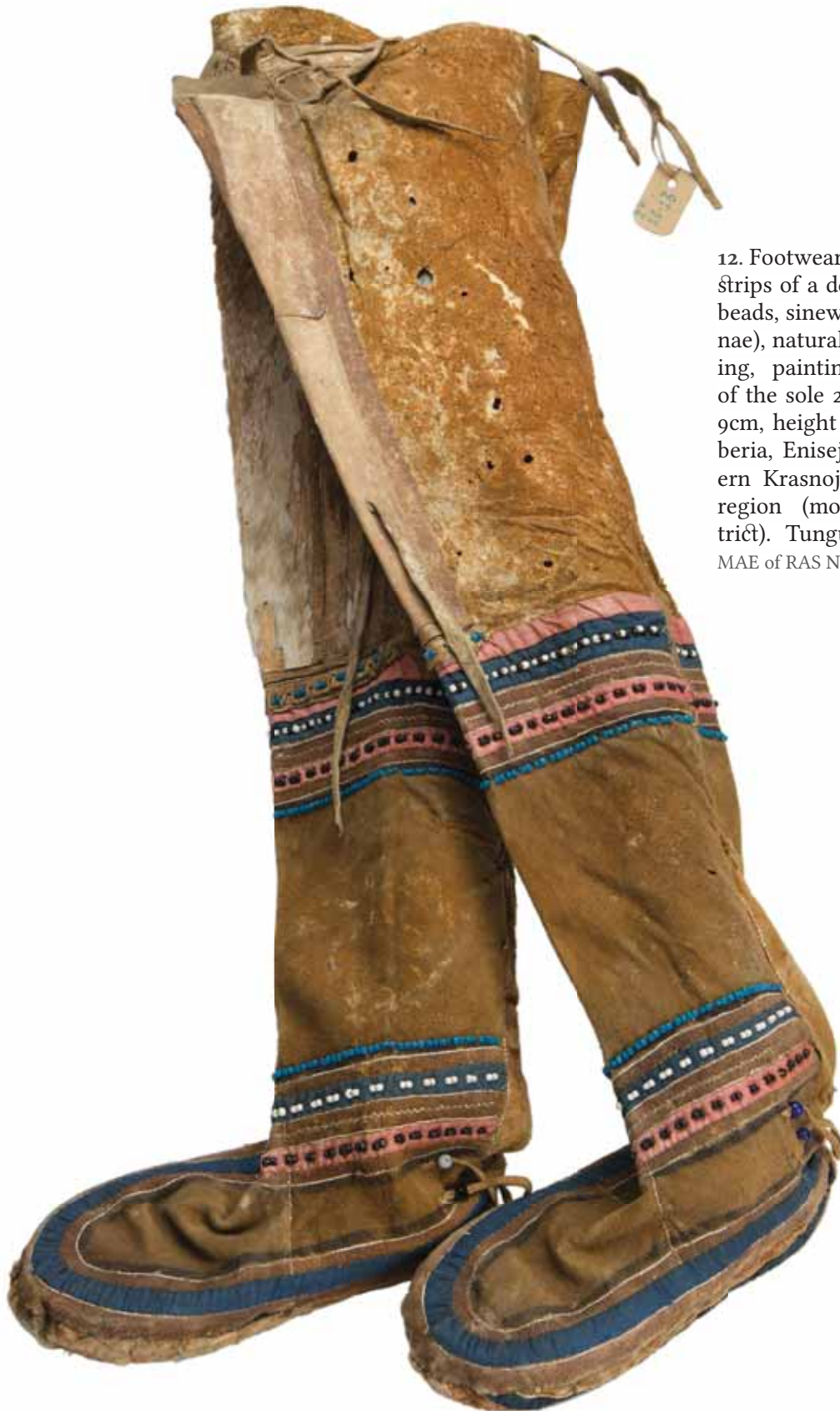
12. Footwear. Tanned deerskin, skin strips of a deer, cotton fabric, glass beads, sinew thread (chordae tendinae), natural colours. Cutting, sewing, painting, beadwork. Length of the sole 23cm, width of the sole 9cm, height of the collar 72cm. Siberia, Enisejsk Governorate (modern Krasnojarsk Kraj), Turuxansk region (modern Turuxansk district). Tungusic people (Evenkis). MAE of RAS No. 27-27 / 1 & 2.