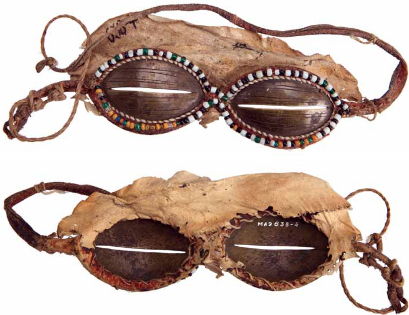
40. Snow goggles. Tanned deerskin, copper, sinew thread (chordae tendinae), glass beads, coarse thread. Sewing, embroidery with beads, moulding, stamping, hatching, perforation. Length 14cm, height 8cm. Siberia, Enisejsk Governorate (modern Krasnojarsk Kraj), Turuxansk region (modern Turuxansk district). Enets. MAE of RAS No. 638-4.