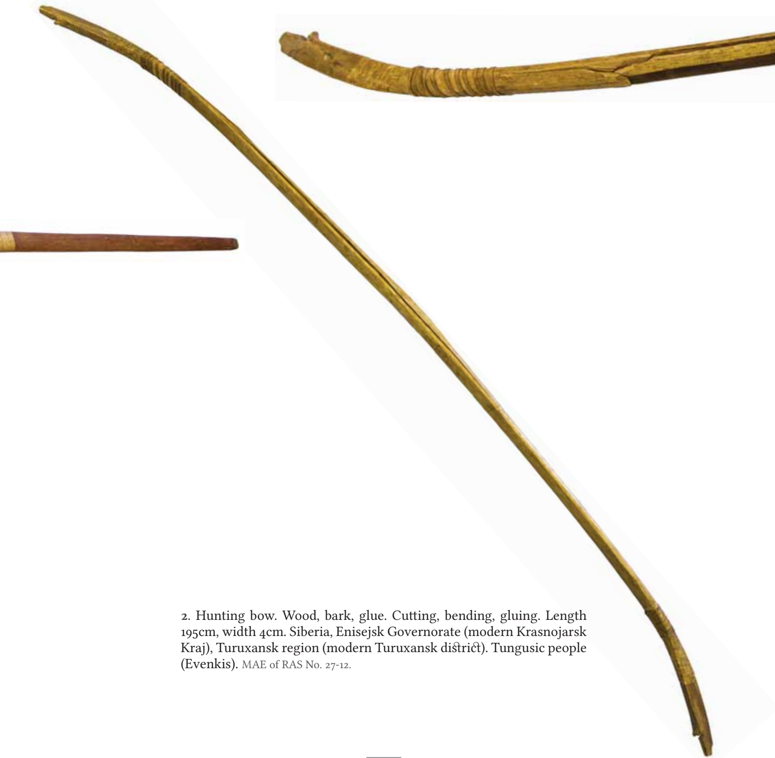
2. Hunting bow. Wood, bark, glue. Cutting, bending, gluing. Length 195cm, width 4cm. Siberia, Enisejsk Governorate (modern Krasnojarsk Kraj), Turuxansk region (modern Turuxansk district). Tungusic people (Evenkis). MAE of RAS No. 27-12.