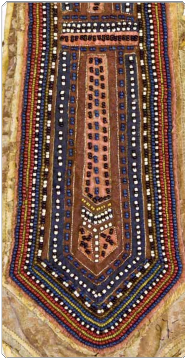
6. Men's bib. Tanned deerskin, leather, goat fur, cotton fabric, sinew thread (chordae tendinae), glass beads, natural colour. Cutting, sewing, beadwork, painting. Length 68cm, width at the base 23cm, width at the top 14cm. Siberia, Enisejsk Governorate (modern Krasnojarsk Kraj), Turuxansk region (modern Turuxansk district). Tungusic people (Evenkis). MAE of RAS No. 27-19.