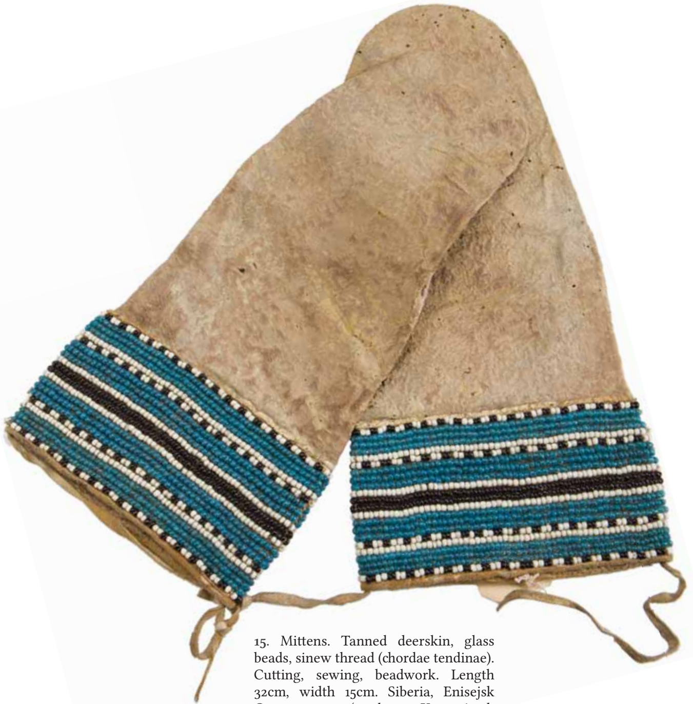
15. Mittens. Tanned deerskin, glass beads, sinew thread ( chordae tendinae ). Cutting, sewing, beadwork. Length 32cm, width 15cm. Siberia, Enisejsk Governorate (modern Krasnojarsk Kraj), Turuxansk region (modern Turuxansk district). Tungusic people (Evenkis). MAE of RAS No. 27-15 / 1 & 2.