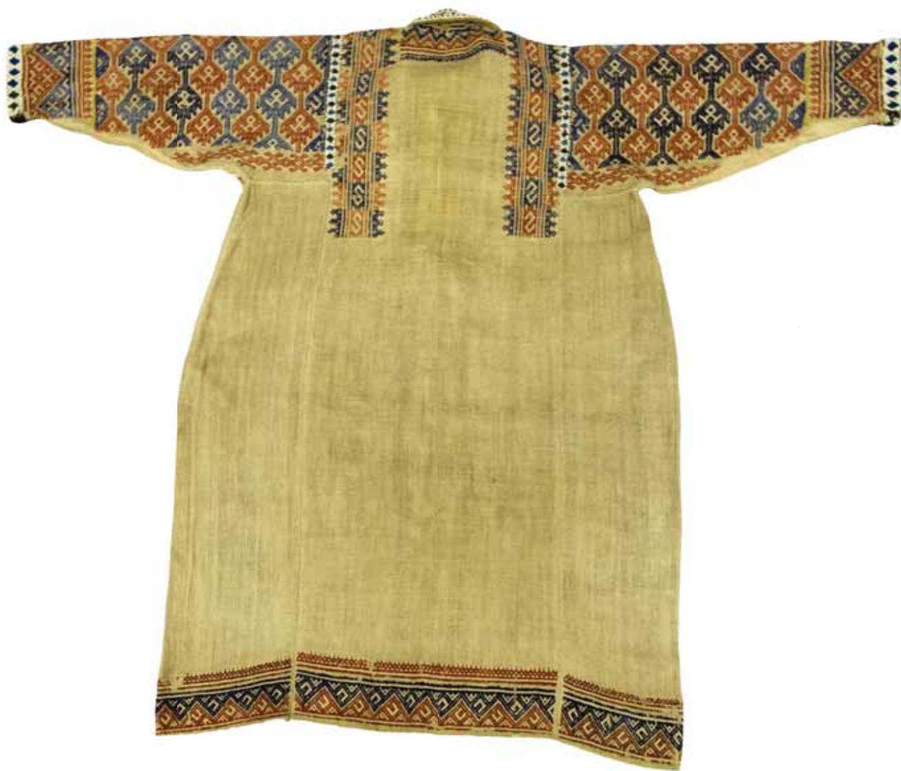
Published: Прыткова, Н.Ф., 1953. Одежда хантов. Сборник Музея антропологии и этнографии XV : 123-233: p. 171, Figure 51. Издательство АН СССР, Москва - Ленинград.