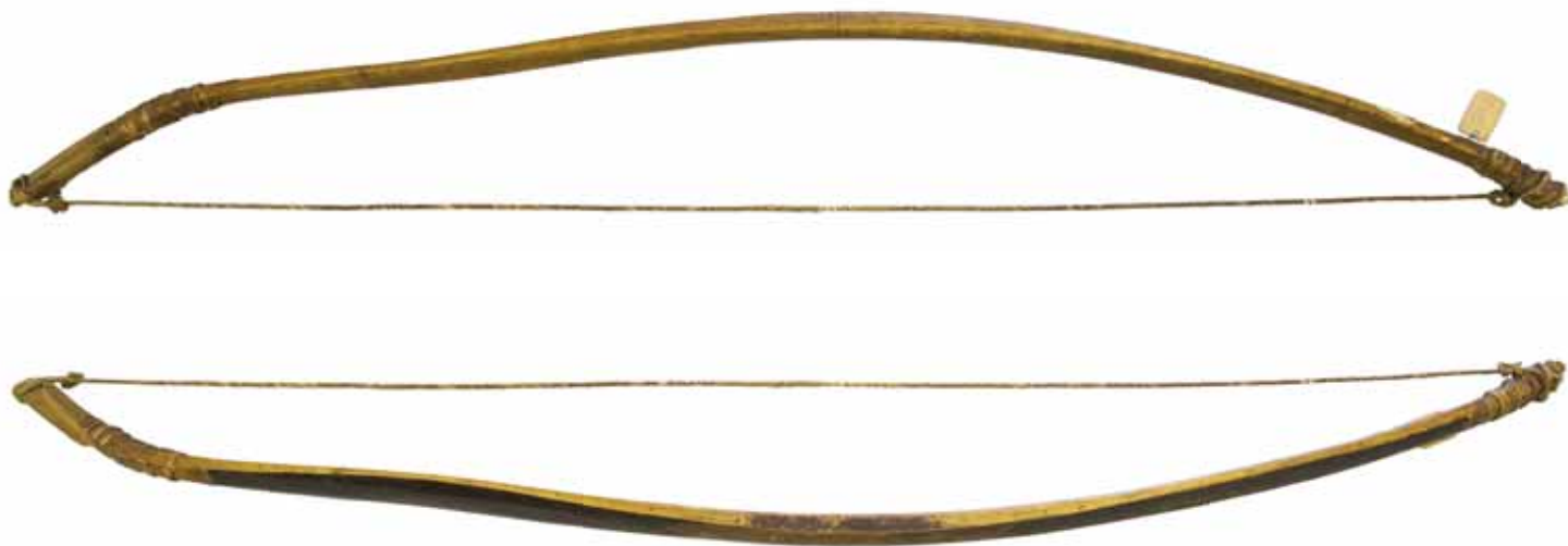
45. Hunting bow. Wood, root, bark, sinew thread (chordae tendinae), glue, colour. Cutting, gluing, colouring. Length 164cm, maximum width 4.5cm. Siberia. MAE of RAS No. 733-3.