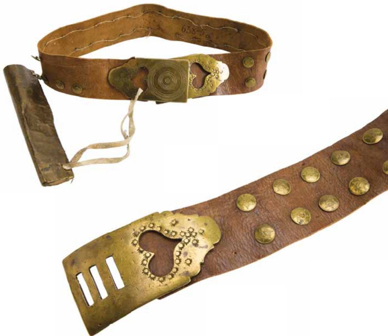
26. Belt. Leather, brass, sinew thread ( chordae tendinae ), elm. Leather dressing, sewing, stamping, wood processing. Length with buckles 87cm, width 6.5cm. Siberia, Enisejsk Governorate (modern Krasnojarsk Krai), Turuxansk region (modern Turuxansk district). Yuraks (Nenets). MAE of RAS No. 638-5a.