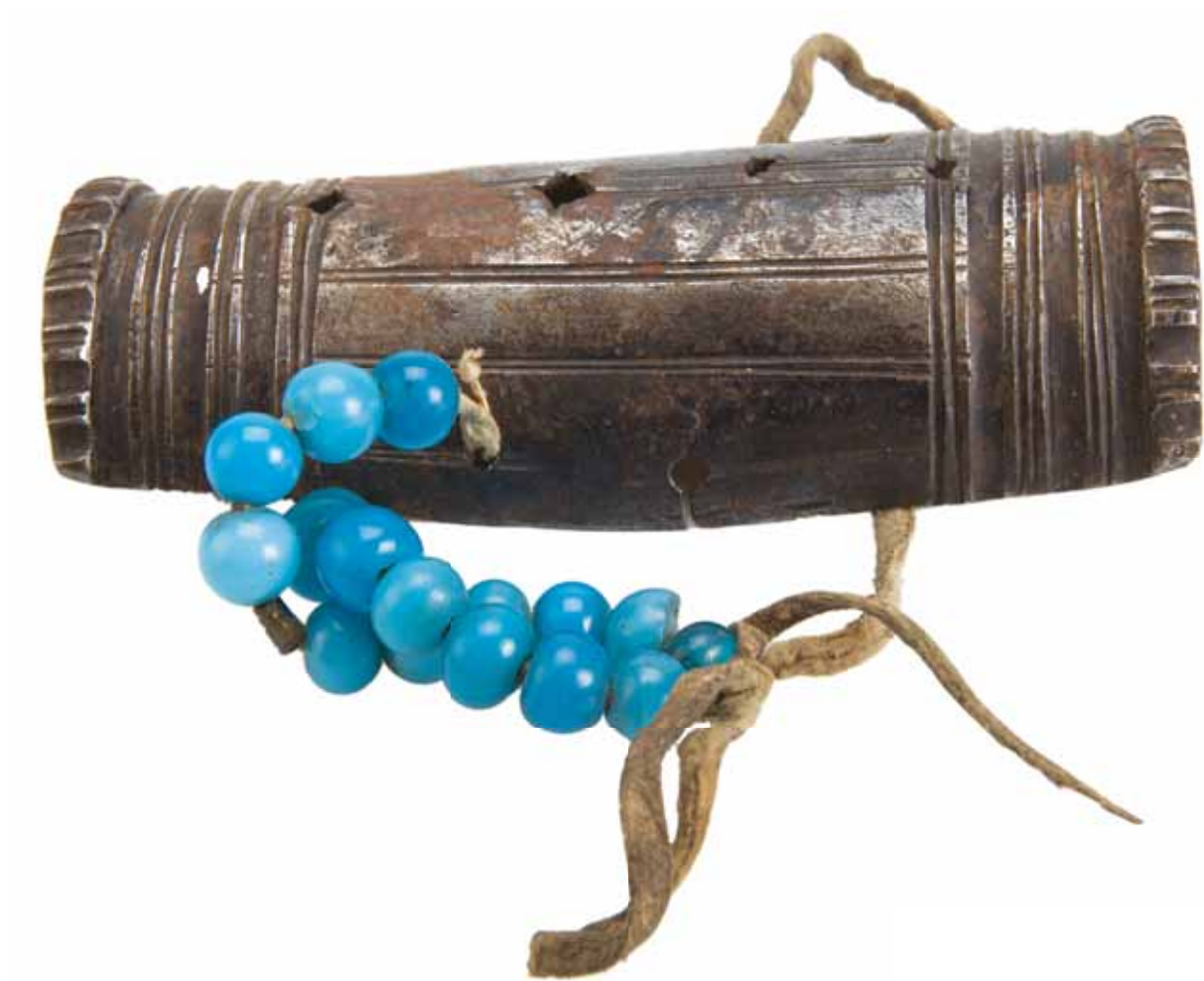
46. Protective plate used for archery. Iron, skin, glass beads. Hatching, skin dressing, lacing. Length 11.5cm, width 4.7cm. Siberia, Enisejsk Governorate (modern Krasnojarsk Kraj), Turuxansk region (modern Turuxansk district). MAE of RAS No. 27-3.