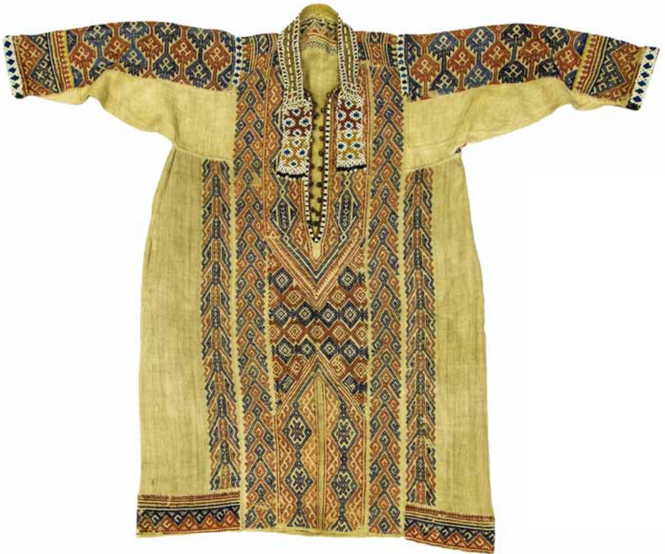
33. Women's shirt. Nettle cloth, woollen thread, glass marbles, glass beads, copper. Cutting, sewing, thread embroidery, moulding, beading. Length 111cm, width at the base 76cm, sleeve length 52cm. West Siberia. Tobol'sk Governorate (modern Tjumen' region). Ostyaks (Khantys). MAE of RAS No. 27-36.