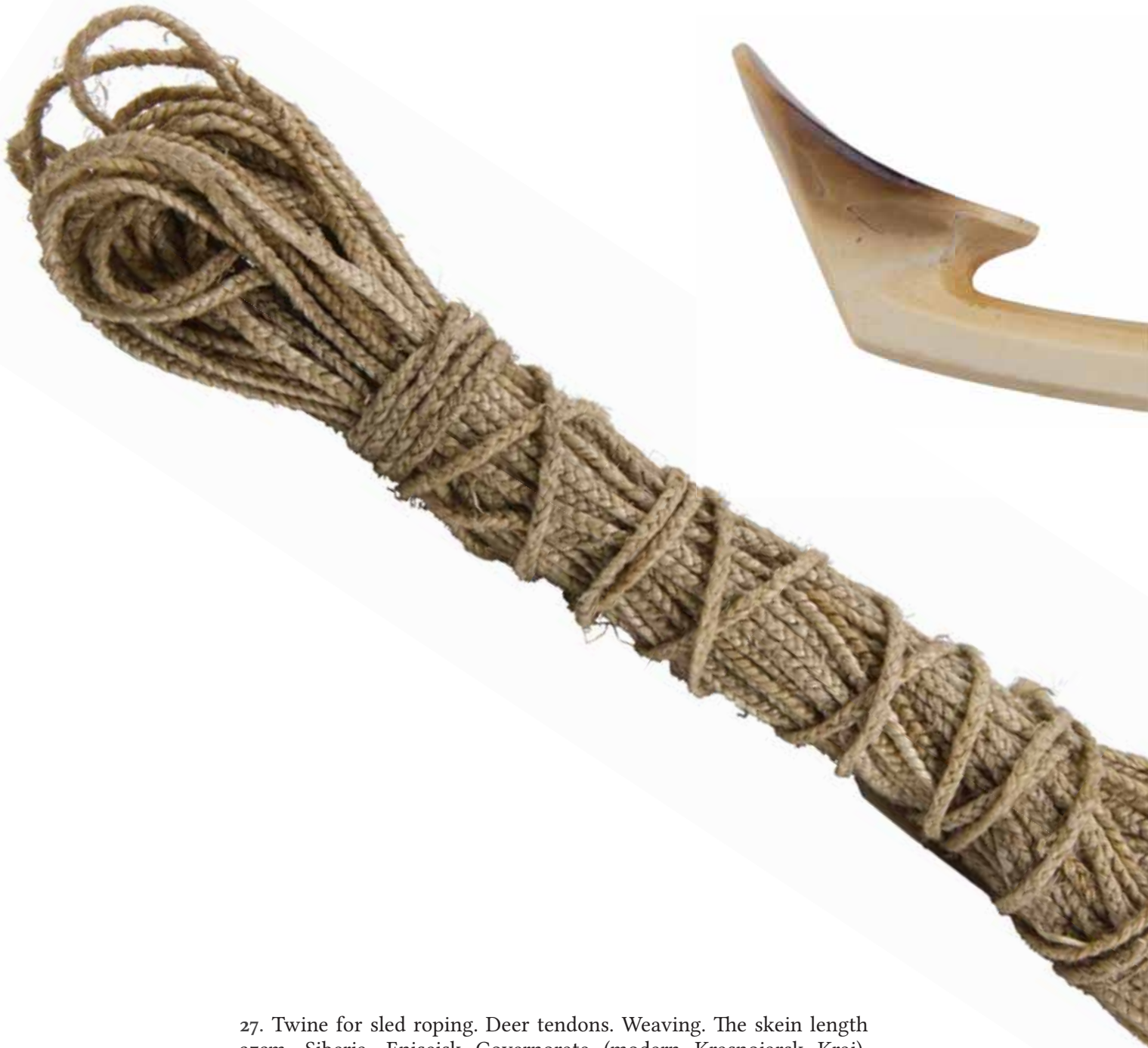
27. Twine for sled roping. Deer tendons. Weaving. The skein length 37cm. Siberia, Enisejsk Governorate (modern Krasnojarsk Kraj), Turuxansk region (modern Turuxansk district). Yuraks (Nenets). MAE of RAS No. 638-6.