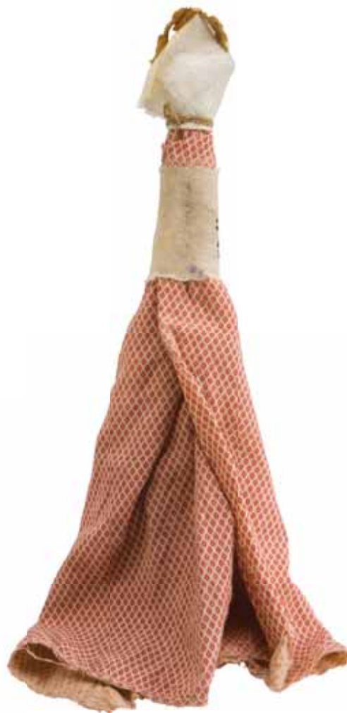
31. Worship item in the form of a doll. The skin of a small, fur-bearing animal, cotton fabric. Wrapping. Height 35cm width at the base 12.8cm. Siberia, Enisejsk Governorate (modern Krasnojarsk Kraj), Turuxansk region (modern Turuxansk district). Yuraks (Nenets). MAE of RAS No. 27-33.