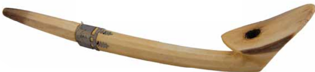
28. Tobacco pipe. Mammoth tusk (?), tin. Bone carving, drilling, hatching. Length 30cm, height with a cup 6cm. Siberia, Enisejsk Governorate (modern Krasnojarsk Kraj), Turuxansk region (modern Turuxansk district). Yuraks (Nenets). MAE of RAS No. 27-6.