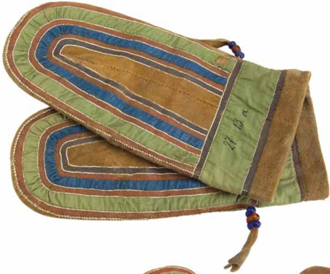
13. Mittens. Tanned deerskin, fabrics, cotton, deer hair, glass beads, natural colours, sinew thread ( chordae tendinae ). Cutting, sewing, dyeing. Length 27cm, width 12cm. Siberia, Enisejsk Governorate (modern Krasnojarsk Kraj), Turuxansk region (modern Turuxansk district). Tungusic people (Evenkis). MAE of RAS No. 27-13 / 1 & 2.